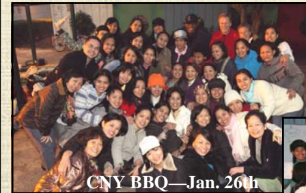
CNY BBQ—Jan. 26th