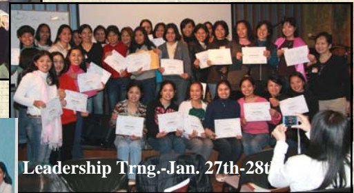
Leadership Trng.-Jan. 27th-28th