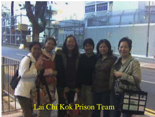
Lai Chi Kok Prison Team